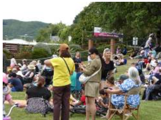
Picture credits: Tawa Rotary: A section of the audience, Red Hackle Pipe Pipe Band arriving, Jive Bombers, Te Rōpū Ngahau Tawa School Kapa Haka, audience.