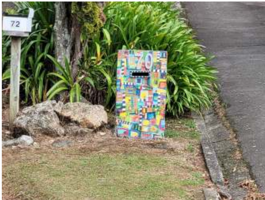
Spotted in Tawa, pretty letterbox!