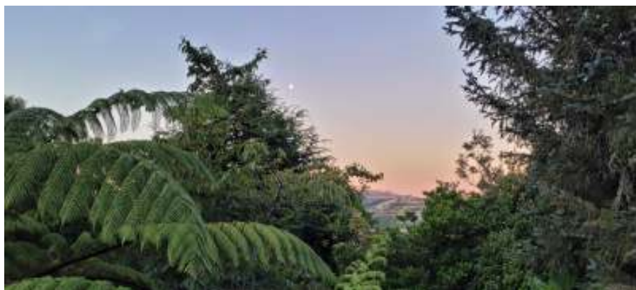
Tawa/Linden gets some fabulous sunsets!