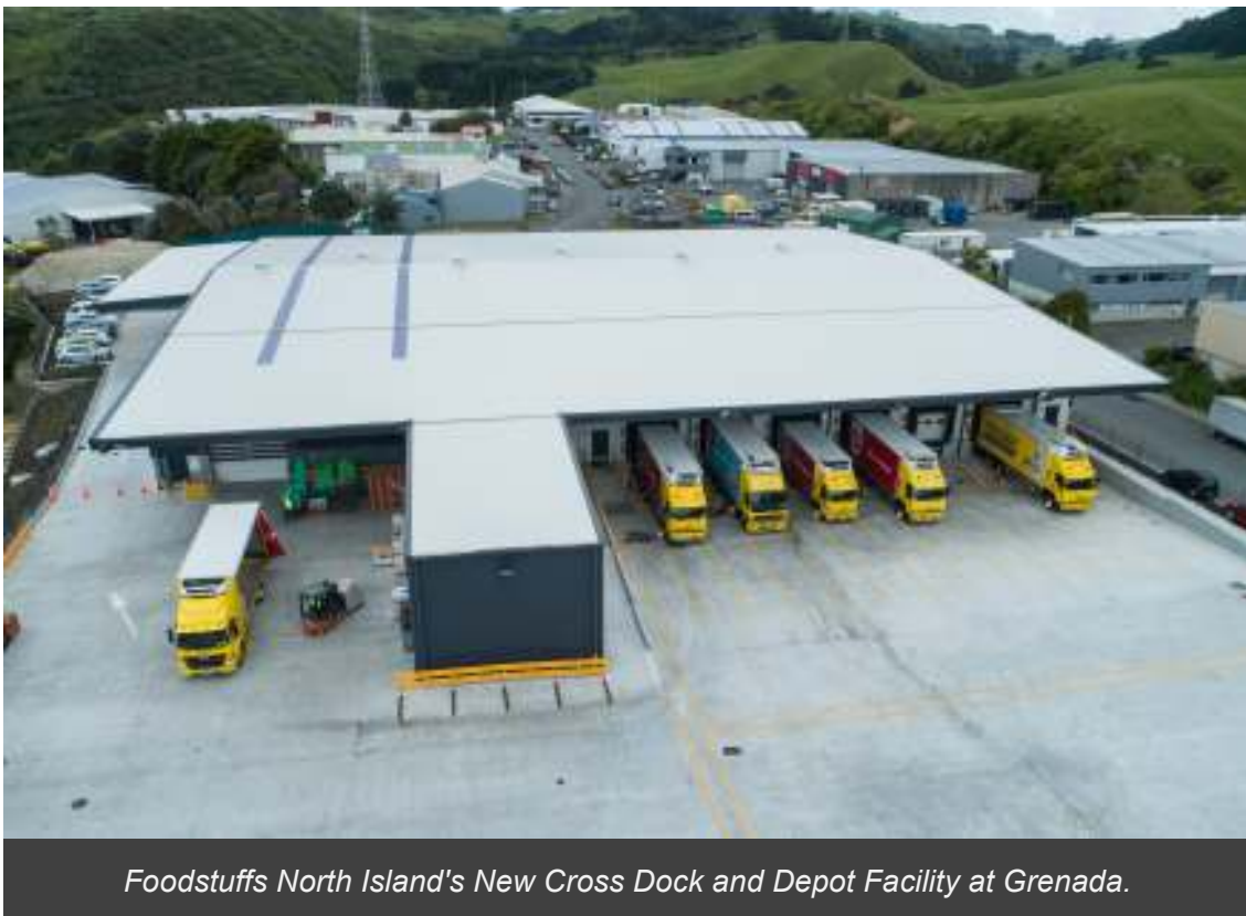
Foodstuffs North Island's New Cross Dock and Depot Facility at Grenada.

The facility will serve as a vital hub for receiving bulk orders of milk as-well-as chilled, frozen, and produce orders from Foodstuffs North Island's Palmerston North distribution centres. The new facility will receive these larger orders while teams efficiently breakdown, sort, pick and dispatch final deliveries to individual stores across the Wellington region utilising a fleet of smaller trucks. Regional suppliers will also benefit from being able to use the site for delivering goods destined for Foodstuffs North Island's larger distribution centres across the North Island.