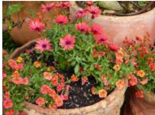
On the left: Contrasting foliage. On the right: Pot up summer colour