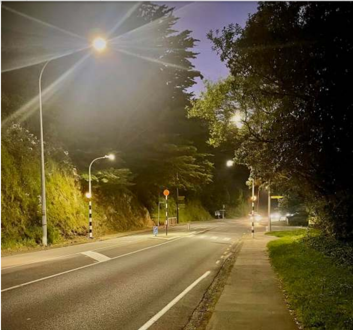
Main Road Tawa at night. From Harley Luf.