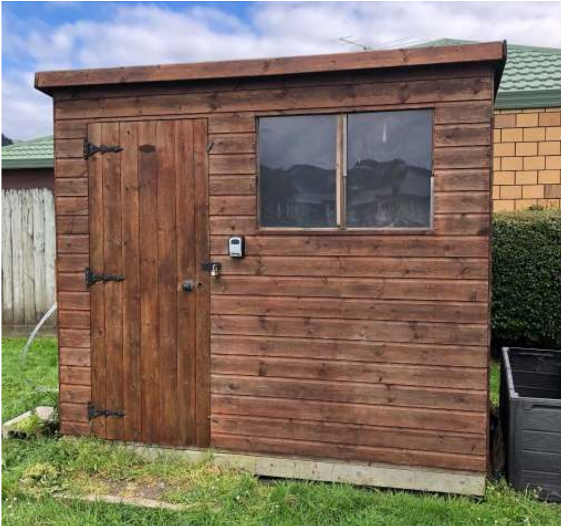
The shed looking good in the new coat!