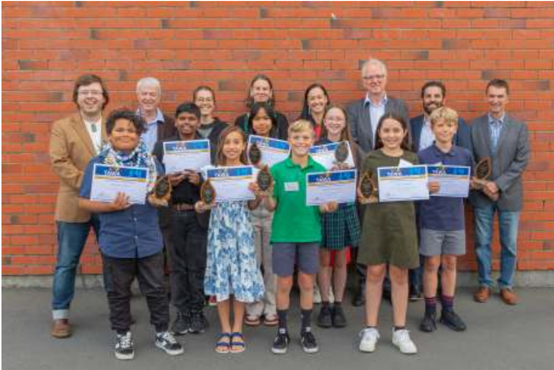
The photo includes Tawa Community Board members, Northern Ward Councillors and Ohariu MP Greg O'Connor and the fantastic recipients of the 2023 awards.