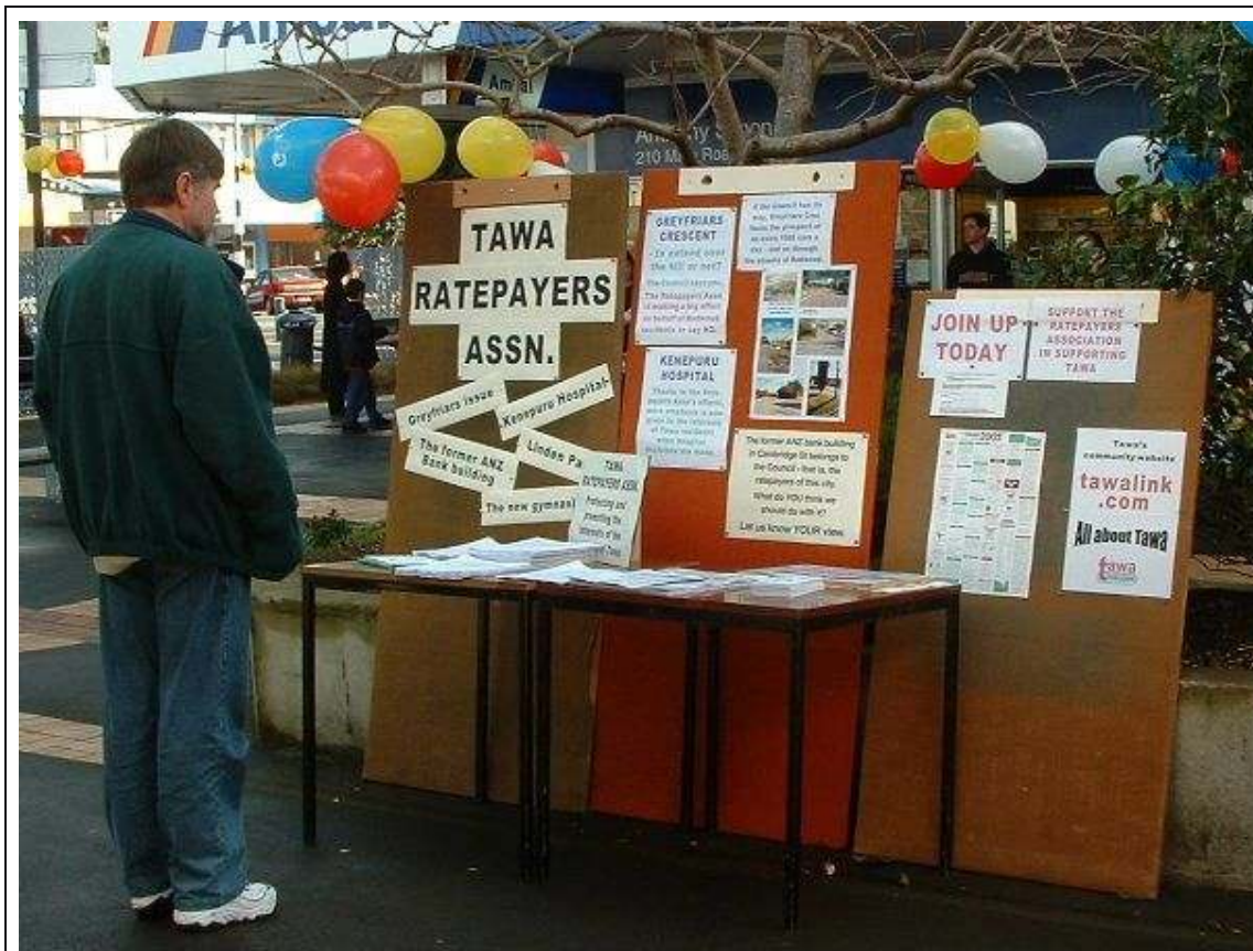
Our First Spring into Tawa in 2003!