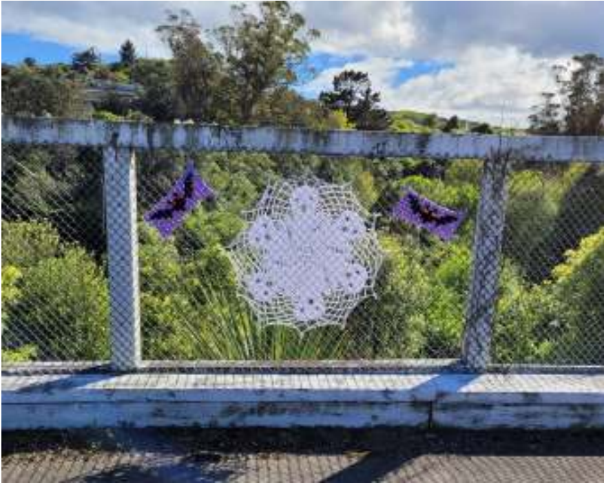
A spooky yarnbomb on display at the Countdown roundabout.

created at home or select something fun to wear from our costumes and props that will be provided. Free for all youth! 3pm-6pm at the Linden Community Centre, Tuesday 31 October.