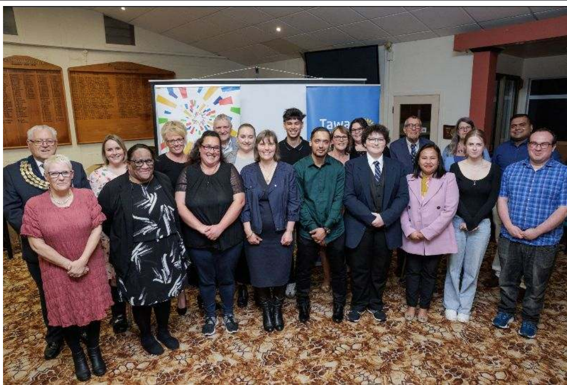
Pride in Work Awards 2023