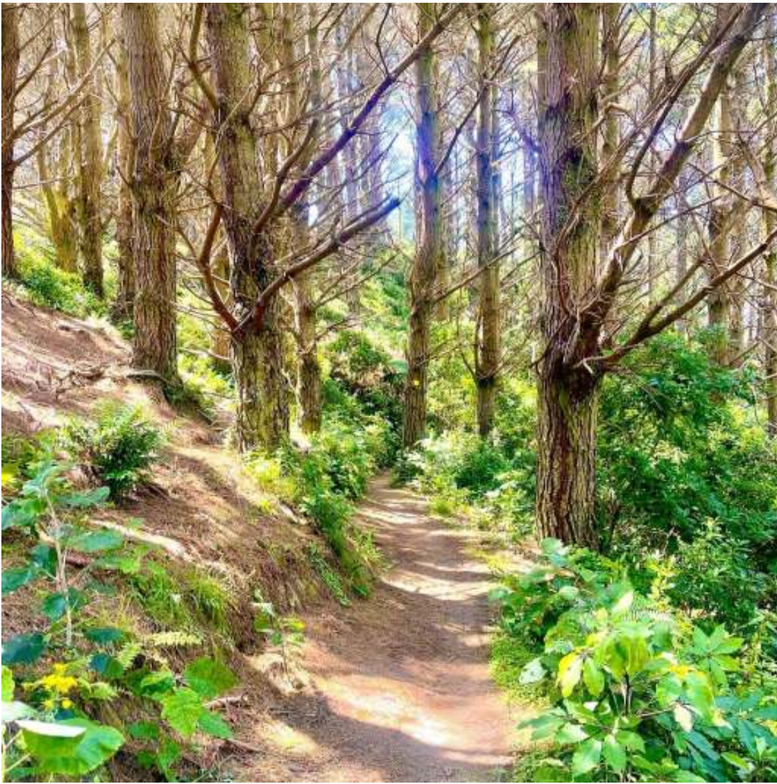
Beautiful path in Spicer Forest, photo by Harley Luf.