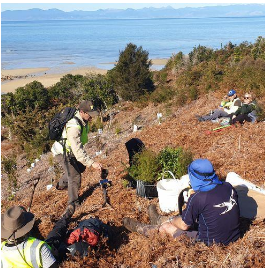
A planting pocket being filled up!

We planted another 500 native trees this season to improve the food source for native birds and improve the visitor experience. The growth from previous years is becoming really visible as you walk this part of the coastal track.