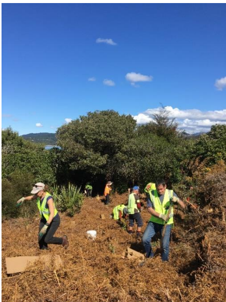
Planting in the sunshine

Volunteers are the backbone of all we do. There is a real sense of connection within the Abel Tasman Birdsong Trust and we do our best to foster it.