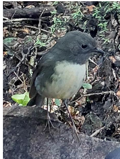
A healthy South Island Robin / Toutouwai helping with a coastal trap check

others like them are known as 'indicator species'. Within biology, an indicator species is one that signals a positive (or sadly negative) change within its environment. The fact that we are seeing more of these birds means our predator control is having a positive impact!