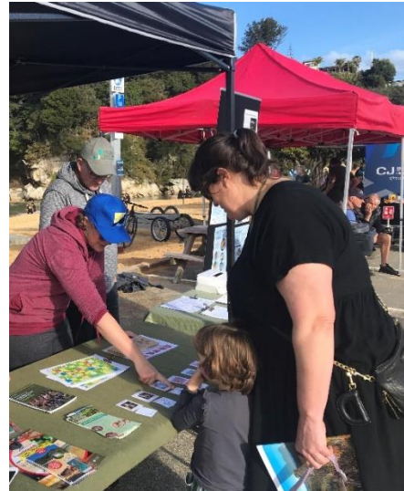
Matching the footprints with the pest

to speak to people about the restoration work in the Abel Tasman, kids even had the opportunity to track a whio (toy) using a real transmitter and telemetry gear!