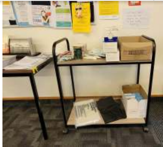
The recycling corner at the Tawa Community Centre and the Swap table.