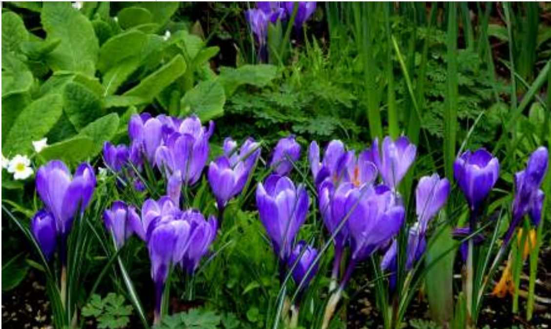
Beautiful Dutch crocus bloom in mid winter.