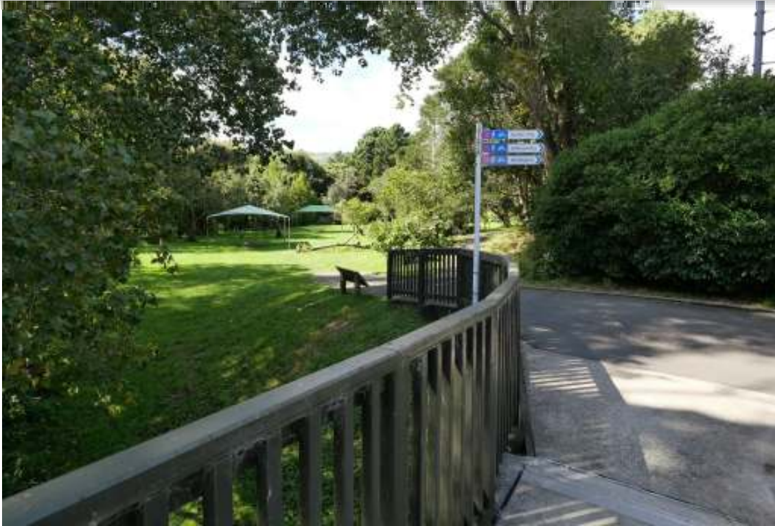
Willowbank Reserve.