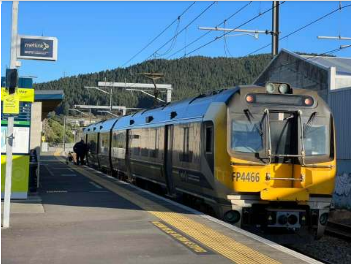
Train station on a lovely day.