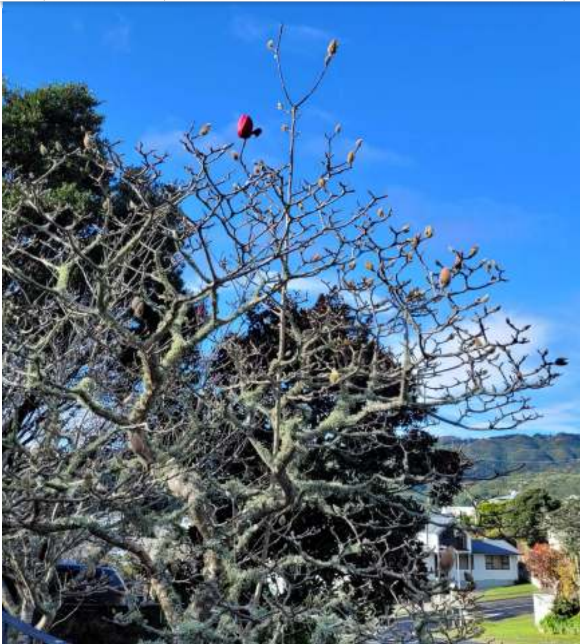
First sign of spring!