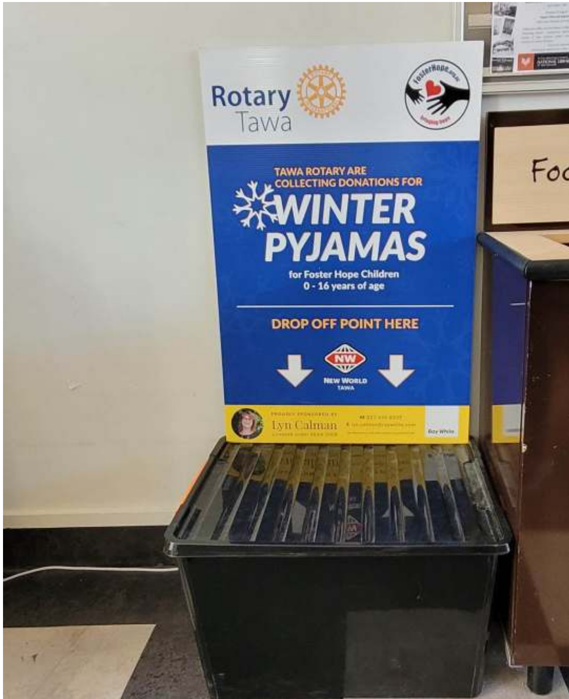
You can still drop off winter pyjamas at the New World.