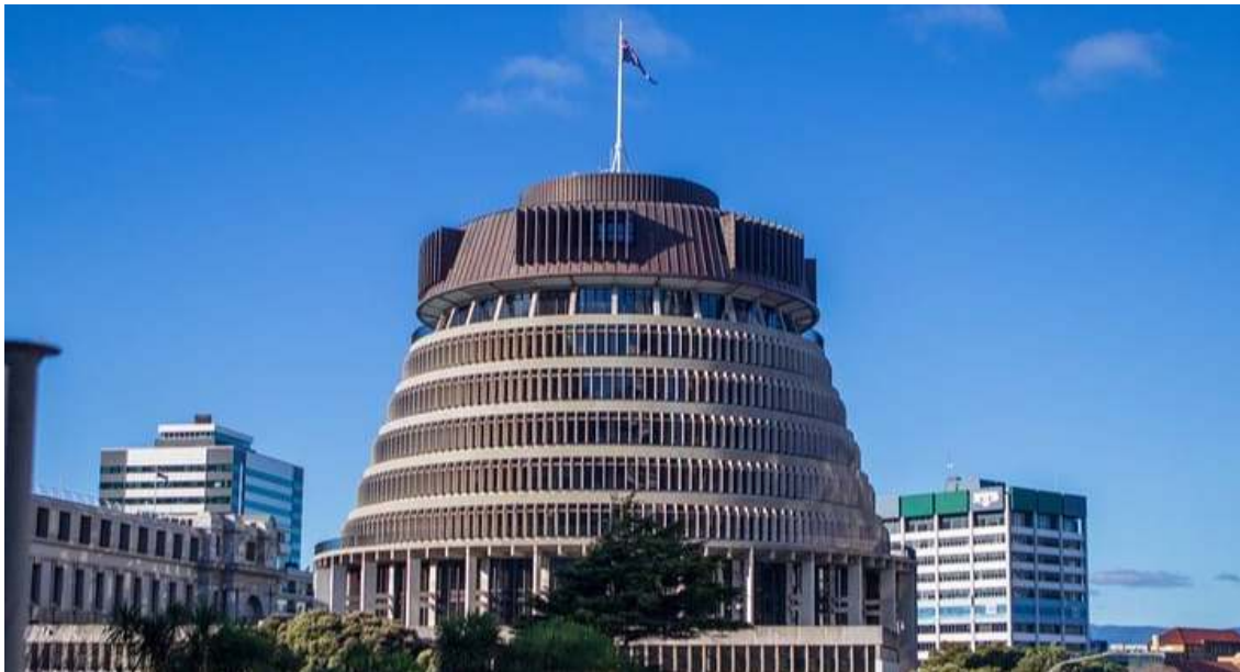
The Beehive is the executive wing of the New Zealand Parliament buildings.