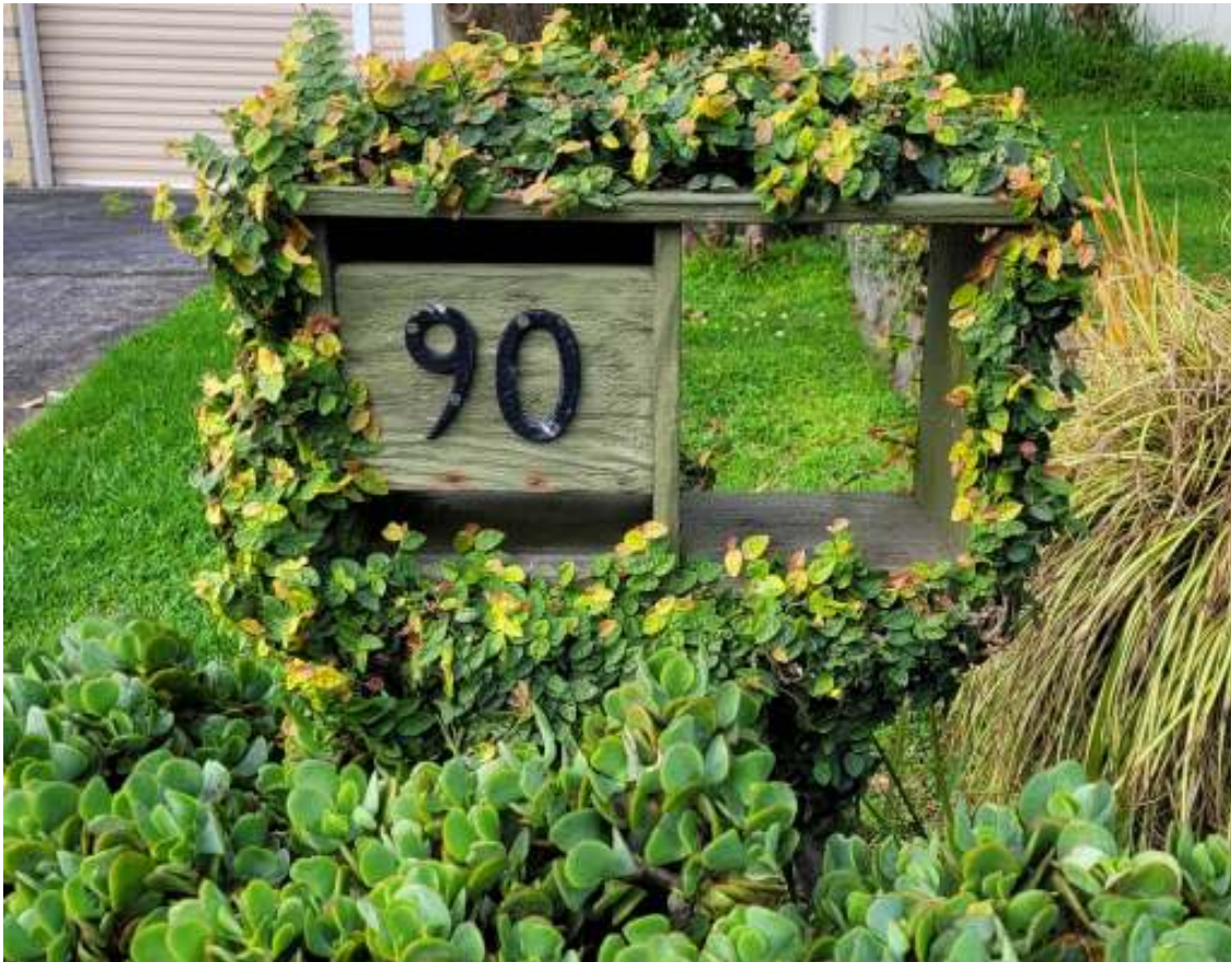
Isn't this the cutest, greenest letterbox in Tawa?