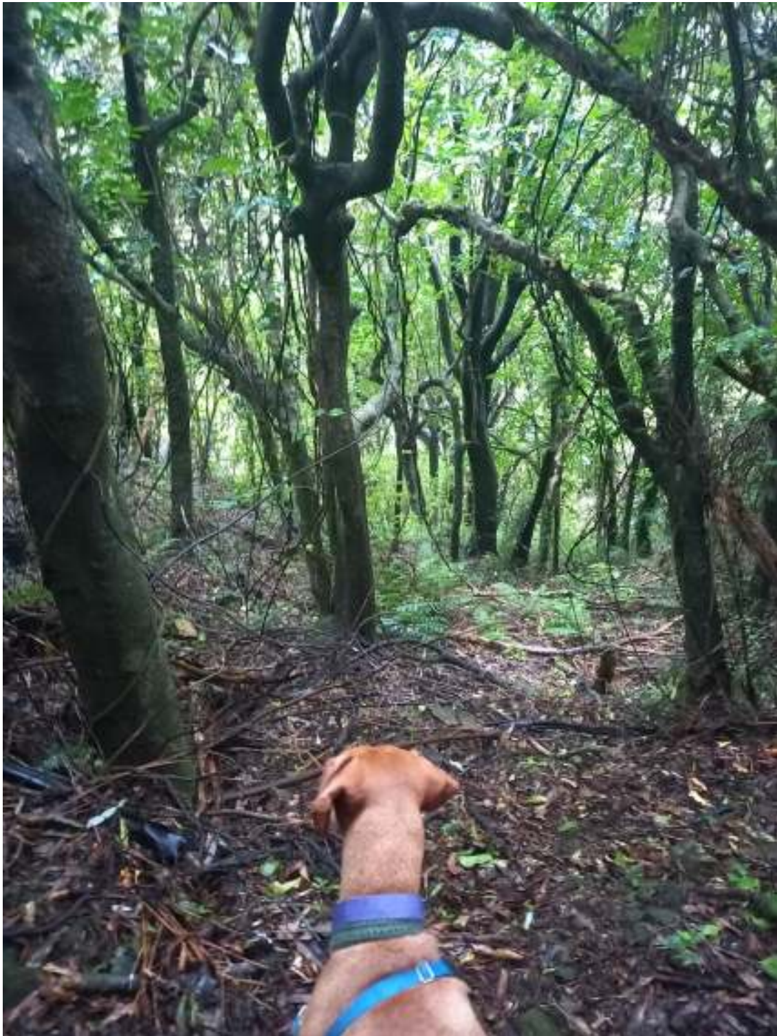
Enjoying Woodburn Reserve.