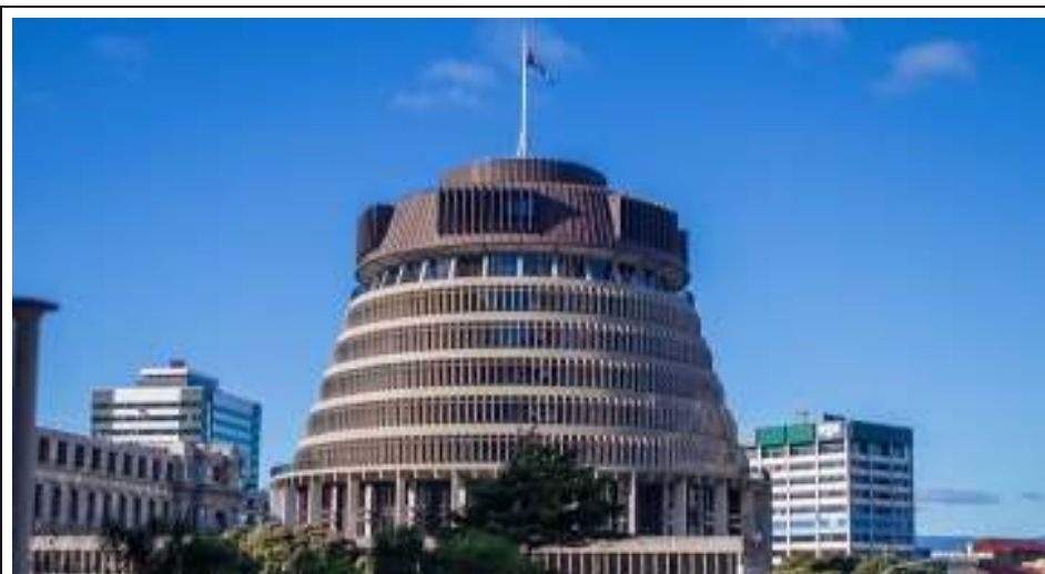
The Beehive is the executive wing of the New Zealand Parliament buildings.