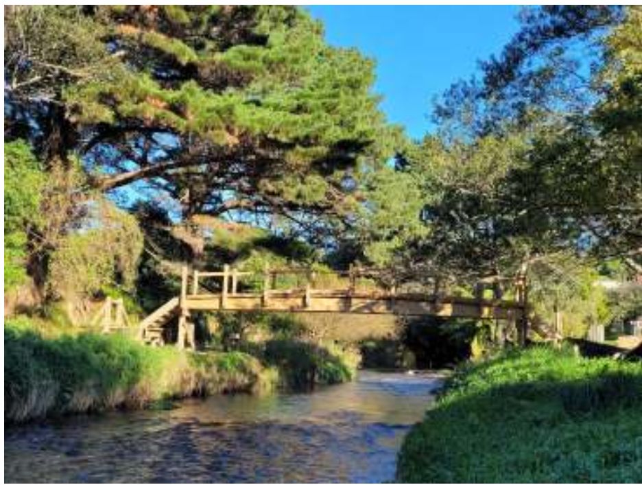
Picture of the bridge at Willowbank Park