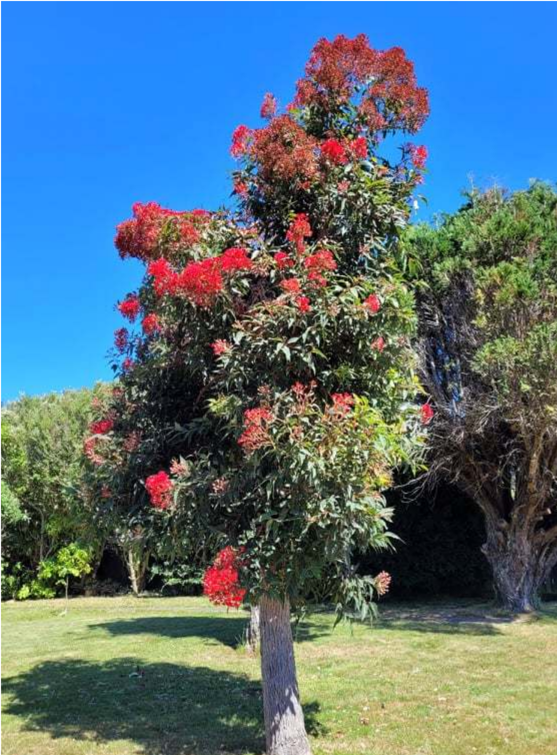
Rata tree in all its glory, you don't see a lot of these in Tawa.