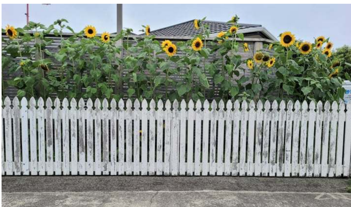
The amazing sunflower display is back, spotted in Tawa.

Did you know you can donate your curtains to Wellington Curtain Bank? If you are thinking of changing your curtains, don't throw them away! You can drop them off at the Porirua library. Read all about this, and other initiatives from Sustainability Trust, here: https://sustaintrust.org.nz/donate-curtain-bank