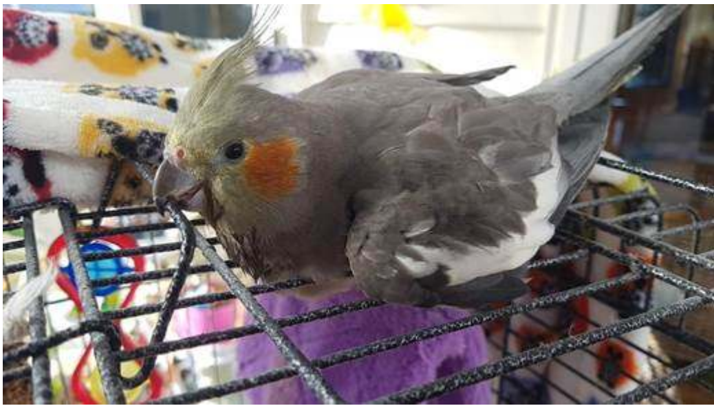
Peachy at home.