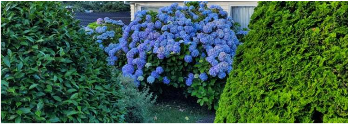
Stunning hydrangea spotted in Tawa.