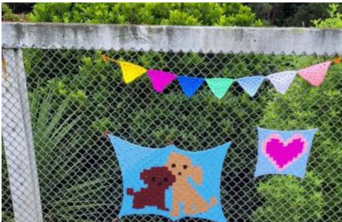
Valentine's Day yarnbombing spotted in Tawa.