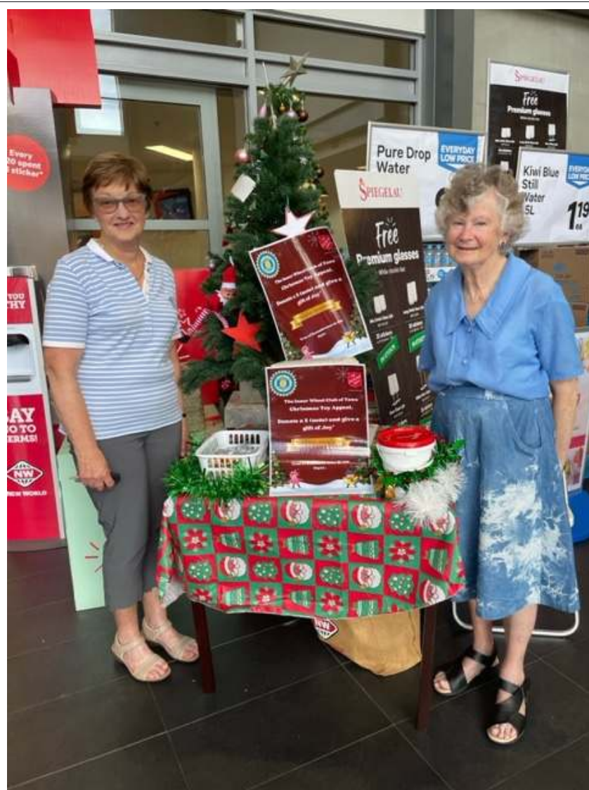
Another great fund raising initiative from Tawa Inner Wheel!