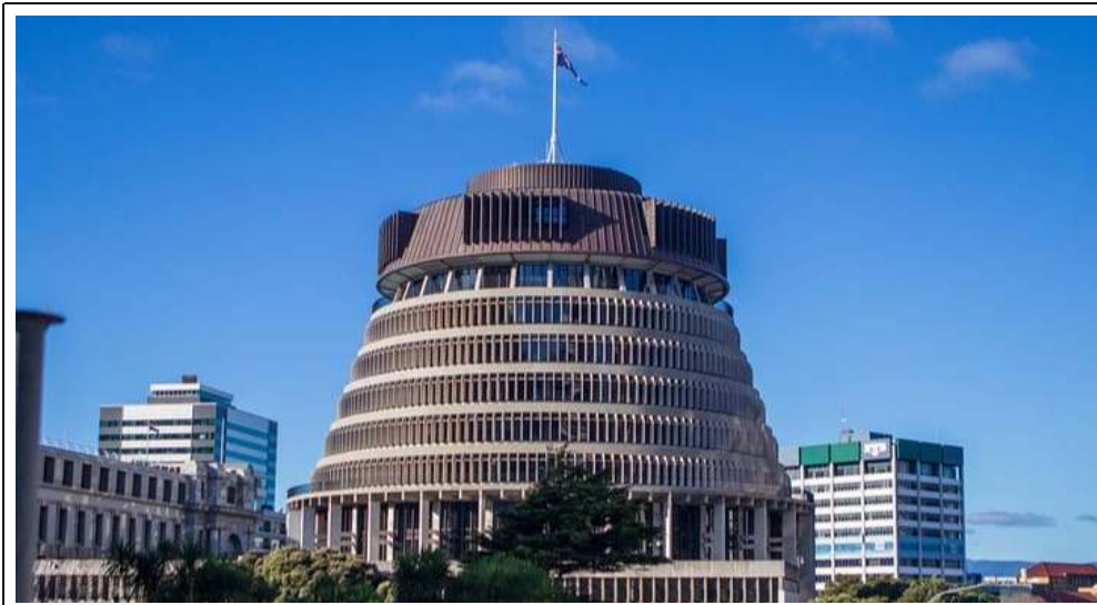
The Beehive is the executive wing of the New Zealand Parliament buildings.

Contact my office at mana@parliament.govt.nz or 237 9842."