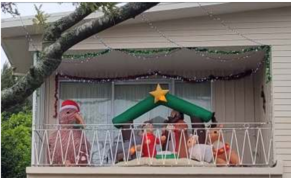
One of the many displays in Tawa/Linden.