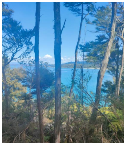
Above: 'New view' from new section of track in the Astrolabe

Tasman District Council has now opened road access to Wainui, Tōtaranui and Awaroa. Please check the Tasman District Council website for all road status information.